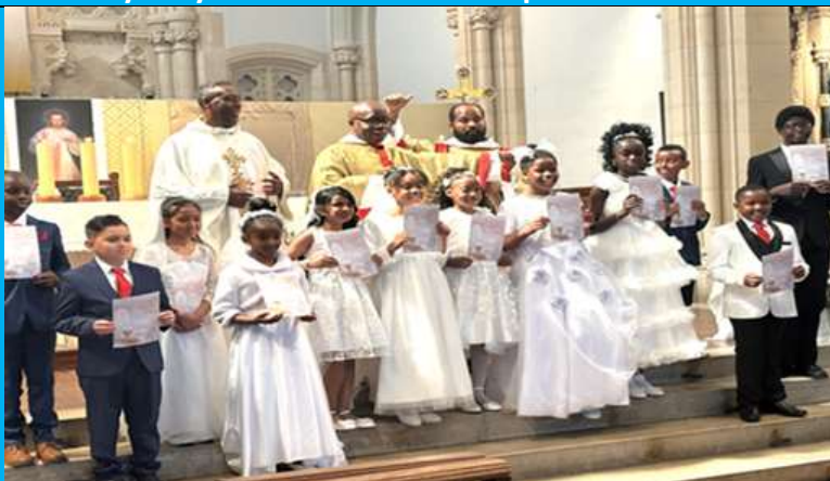
Sunday May 11 th For Our Second Group