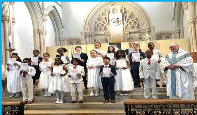
Sunday May 4 th For Our First Group and Their Families

IT WAS A MOST MARVELLOUS MONTH OF MAY! OUR PUPILS RECEIVED THEIR FIRST HOLY COMMUNION