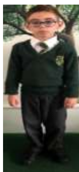
Yr. 1-6 Boys