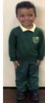
EYFS Boys & Girls