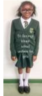
Yr. 1-6 Girls