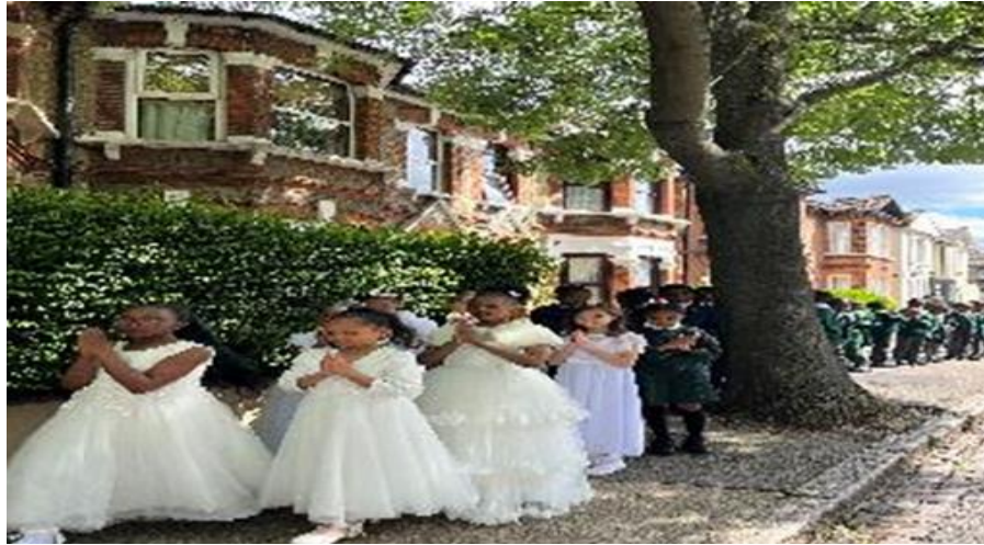
Marian Procession around the school community in May