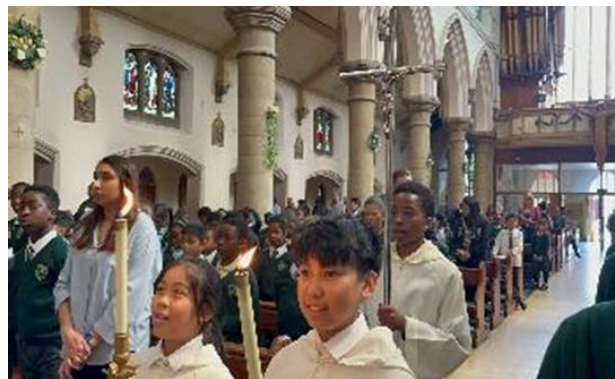
Pupils Serving and Participating In Mass