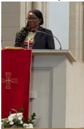
Proclaiming the Word

CAFOD Family Fast Day, Holocaust Memorial Day.