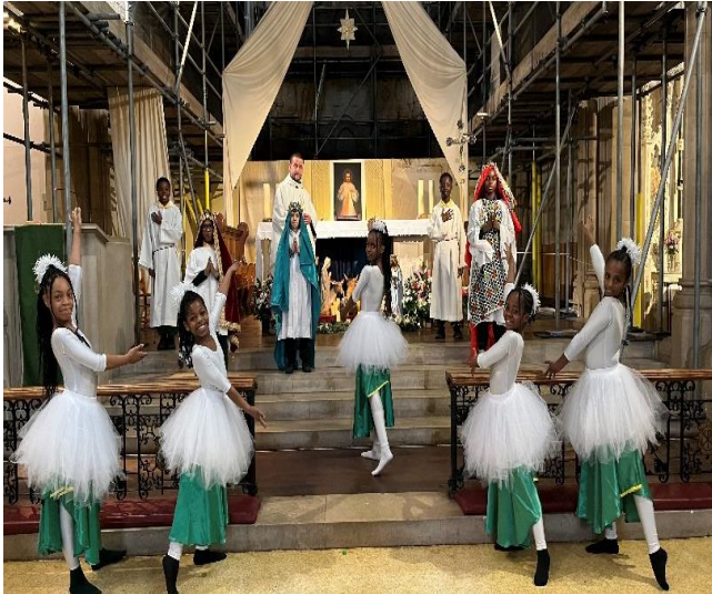
Christmas Nativity Production in Church