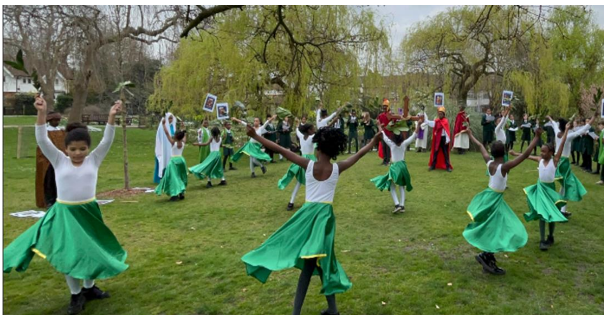
Jesus' Triumphant Entry to the Hymn: Enter into Jerusalem Let Us Go to God's House