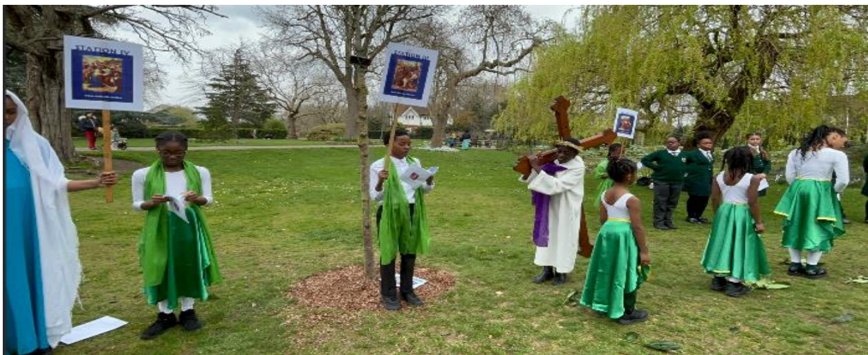
Stations of the Cross in West Ham Park draws a big community audience in prayer and reflection