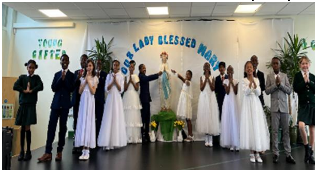
The Crowning of Our Blessed Mother in Assembly in May