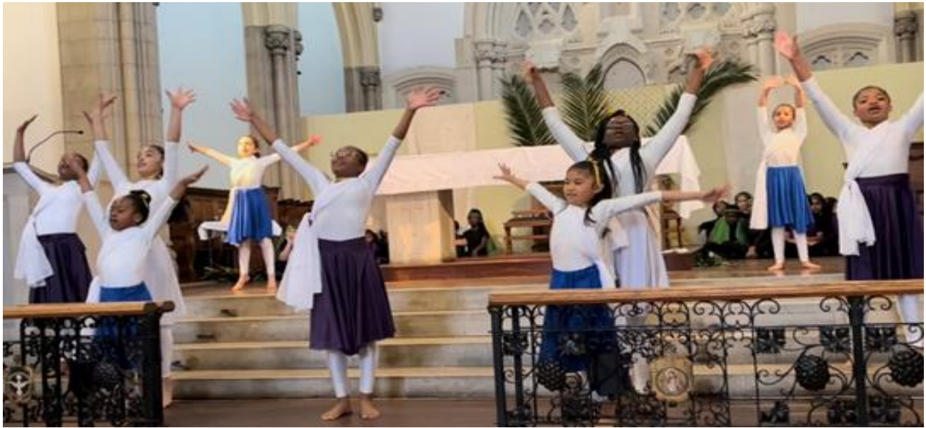
The Finale of Our Easter Production : Alleluia! He Is Risen!