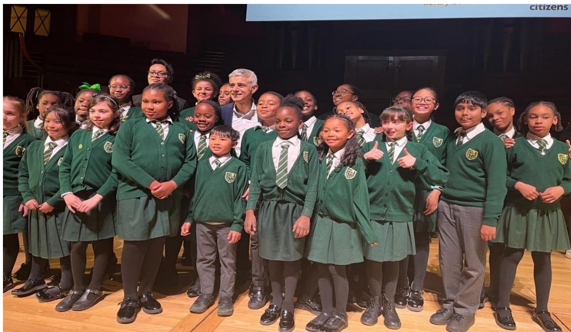
Faith In Action: St Antony's Choir's Message in song at the Mayoral Assembly in Central London- Asking for stronger Government action on Housing and Homelessness (Catholic Social Teaching)