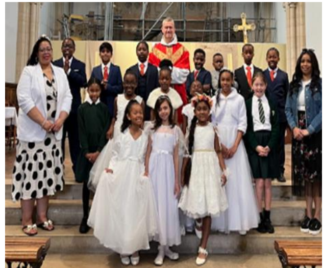
Preparation for and Receiving First Holy Communion

Children in Year 4 upwards join with their parents, other members of the Parish community and the priests of the Parish in preparing for the Sacrament of First Holy Communion. The school fully supports the work undertaken by the Parish in preparing the children as a number of the Catechists are members of staff and the parent body.